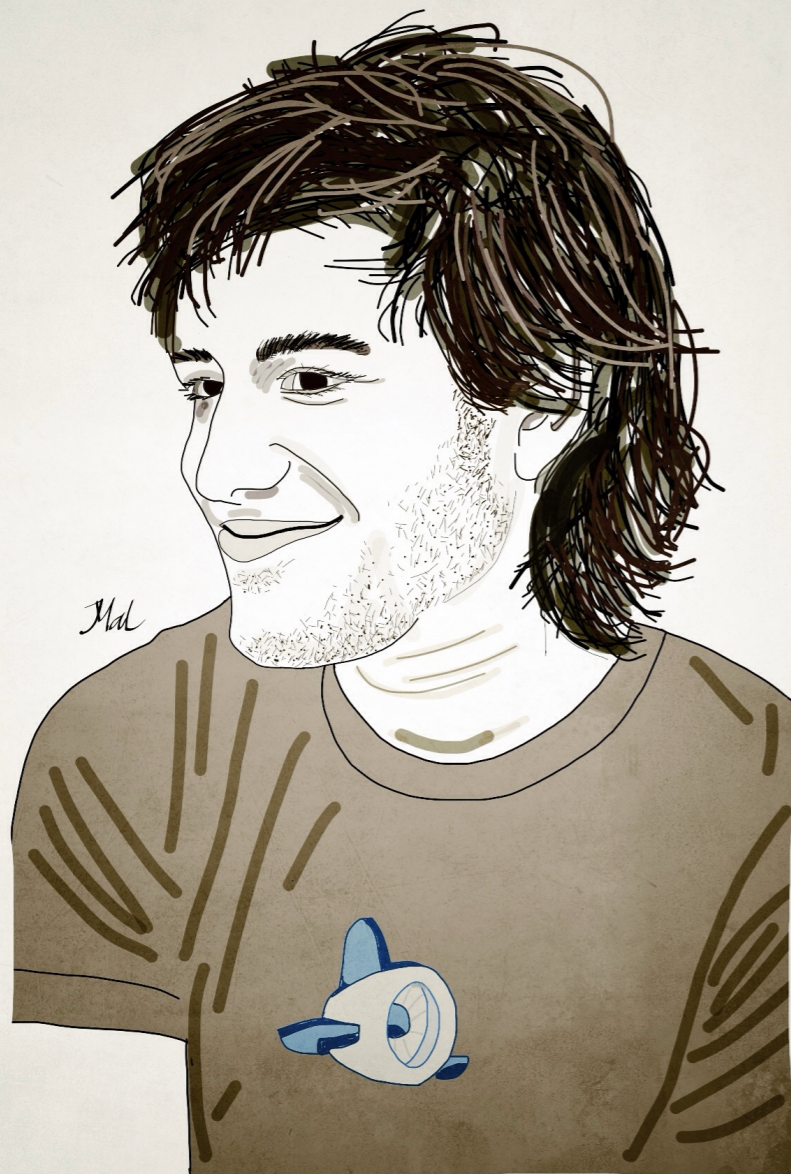
AARON SWARTZ, 1986-2013